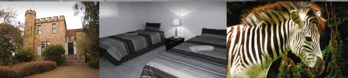
The restoration of the Conference/Training Centre and accommodation block kindly sponsored by Africom (Holland)

The headquarters of the WLS is situated in the Kenneth Stainbank Nature Reserve some 20 minutes from the Durban City centre. This 253 hectare "green lung" is reputed to be one of the last remaining nodes of coastal bush and carries a variety of antelope species, zebra, abundant birdlife and butterflies.